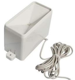
Up to 1 additional digital and 1 analog sensor